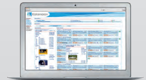
Output Streams View

Combine with WISI's CHAMELEON or TANGRAM modules to efficiently receive and transcode off-air sources and deliver them to multiscreen devices