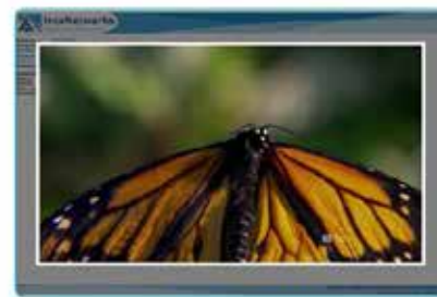
Click to Full Frame

WISI Communications GmbH & Co. KG P.O. Box 1220 75219 Niefern-Oeschelbronn, Germany